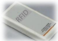
Data receiver – To upload and download data from multi lock

Intel Pentium4 1.8GHz above, 512MB RAM, 50GB Harddisk Storage, 1024x768 Resolution