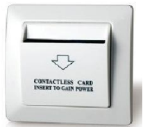
Energy Saver switch