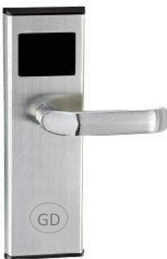
Electrophoresis technique treatment, ANSI 5 latches mortise, Convenient for management