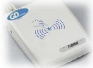
RFID Card Reader - RFID Card Reader (For setting the card with software)